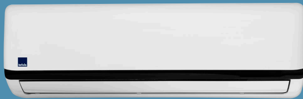
4.2kW & 5.0kW