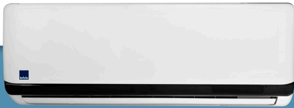
2.6kW & 3.2kW